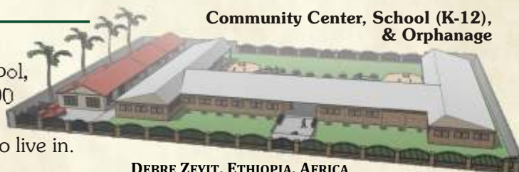
Community Center, School (K-12), & Orphanage

Constructing a classroom is our part of the big picture; the Adana Children Center project. In addition to being a school, the center also serves as a Community Center serving 4,600 families in the community, an orphanage and a boarding house for up to 24 children or missionaries to live in.